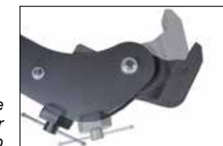
Adjustable jaw tips for more grip