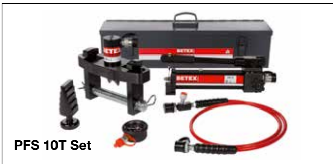
PFS 10T Set