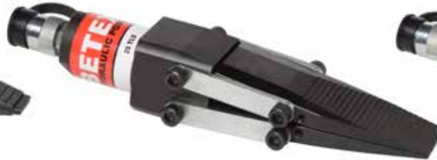
25 TLS lifting wedge / spreader