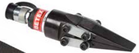
15 TLS lifting wedge / spreader

These patented Special Tools are easy to use and designed to spread or lift loads such as motors, gearboxes and flanges with ease and superior accuracy.