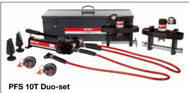
PFS 10T Duo-set