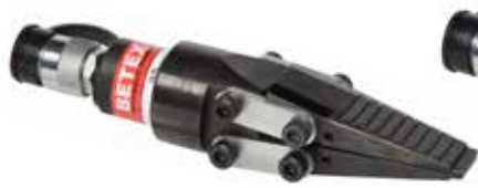
15 TL spreader