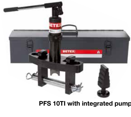
PFS 10TI with integrated pump