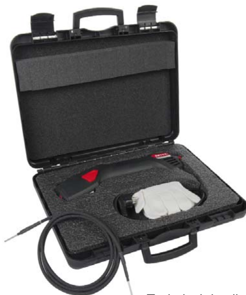
Technical details page 34